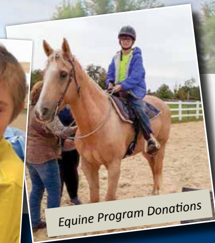
Equine Program Donations