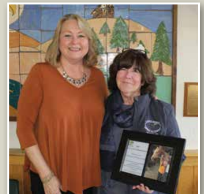
12 th Annual You've Got a Friend Award Lakes Region Riding Academy