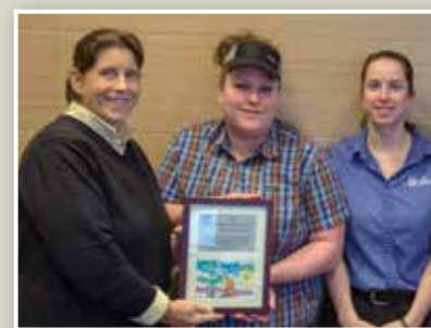
12 th Annual You've Got a Friend Award Taco Bell Tilton