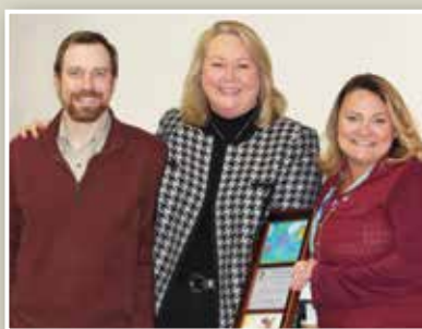
10 th Annual Arthur H. Nighswander Community Partner Award Just Flow Events & Marketing

Spaulding Youth Center was proud to publicly recognize two community award recipients during this year's Thanksgiving Celebration. The Arthur H. Nighswander Community Partner Award was presented to Just Flow Events & Marketing, our marketing and communications partner who has dutifully stewarded our brand and messaging for nearly four years. The You've Got a Friend Award was presented to Taco Bell Tilton for co-developing vocational internships and employment for our students as well as their donations of campus meals for students and staff.